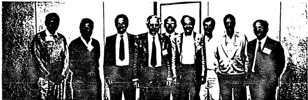
FOUNDING BOARD OF DIRECTORS AND STEERING COMMITTEE