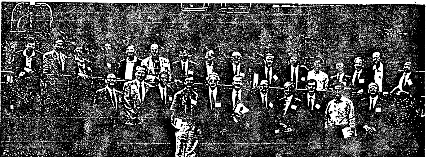
FOUNDING MEMBERS OF IA-FraMCoS