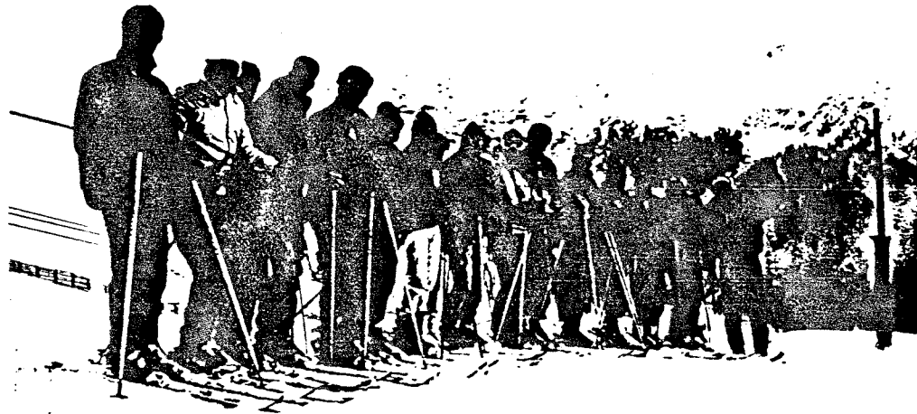
LINE UP OF SKI PARTICIPANTS

The first social event was the ski outing and slalom race on the morning of 1 June, prior to the start of the conference in the afternoon. Ignacio Carol, the winner of the slalom ski race at an earlier conference held at Zell-Man-Zee, Austria (1990), organised the ski outing, in an excellent manner. Twenty-two participants travelled to the nearby Arahapoe ski resort, the highest elevation resort in the US. The mountains, under rapidly moving clouds and occasional glimpses of sun, offered a dramatic view. Thanks to stormy weather which deposited a few inches of powder snow on a hard base, the skiing conditions in the upper part were good.