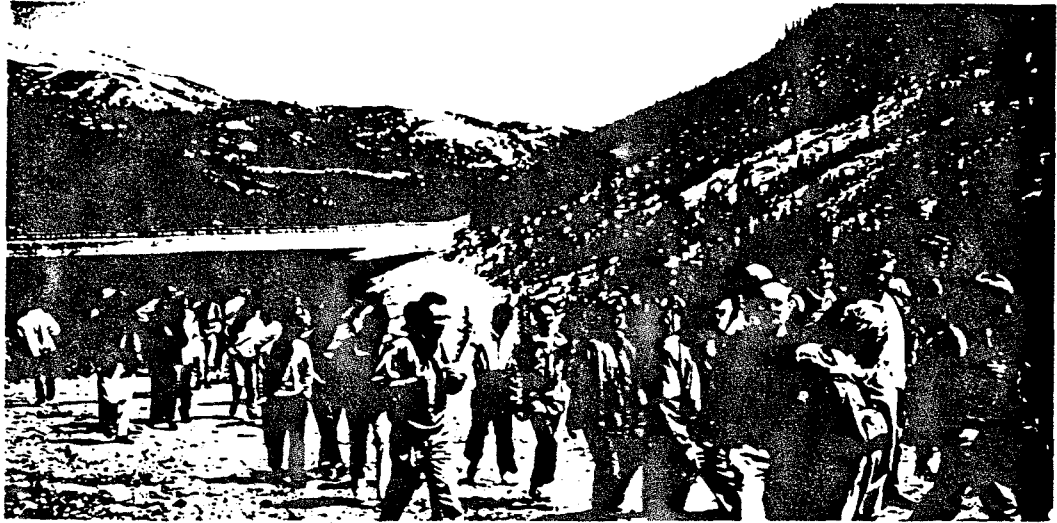
CONFERENCE HIKE PARTICIPANTS

Another organised event - a conference hike - was held during the Tuesday afternoon. About sixty conference participants went by cars over Hoosier Pass and hiked the valley under Mt. Lincoln from Montgomery Reservoir towards Wheeler Lake. After earlier rains, thunderstorms and even snowstorms prior to the start of the conference, the weather cleared for the Tuesday afternoon hike. The valley was placid and the views spectacular which encouraged every hiker to make it past the abandoned old mine. Many reached the upper portions of the valley and a few even reached the high altitude lake (3700m), despite having to cross many snow fields and swollen creeks.